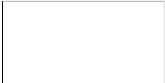
This space may used for the Prescriber's Address Stamp

Prescriber's Signature: _____ Date: _____ (Original signature or signature stamp ONLY)